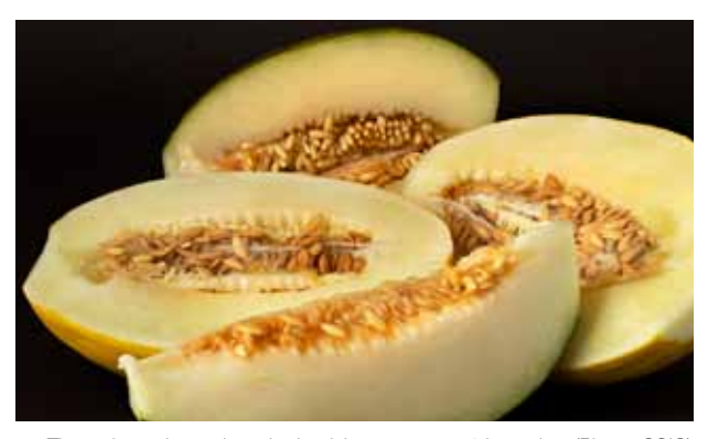
> The melonomics project obtained the sequence of the melon.