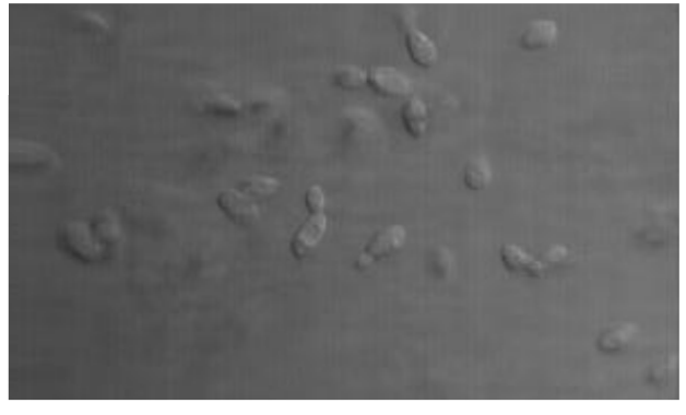
> Dekkera Bruxellensis, one of the most important yeasts for wine production.