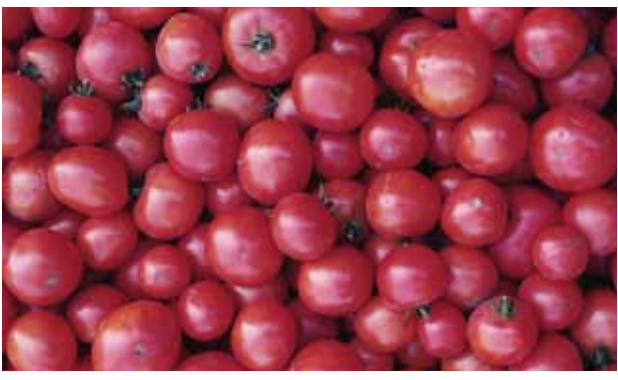
> The sequenced tomato (Solanum lycopersicum)

Finally, work led by the University of Lund (Sweden) in collaboration with the CRG has described the genetic map of the yeast Dekkera bruxellensis . This yeast plays an important role in wine production, particularly by defining its aroma. The sequencing of Dekkera offers a new range of possibilities to wine producers and at the same time helps us better understand its evolution. The researchers studied the genetic basis of the yeast and the properties of this genetic basis which may be relevant for the production of wine. <