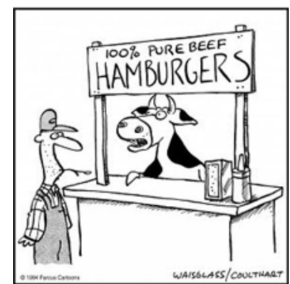
"What conflict of interest?! I work here in my spare time."